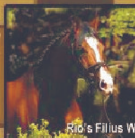
Rio's Filius W

Rio's Filius W , 1998 Hanoverian Stallion, Rio Grande x Sandro Spitting image of his legendary sire