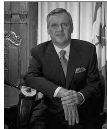
The Honourable David C. Onley, O. Ont.

been presented with the King Clancy Award for Disabled Persons, the Courage to Come Back Award, and the Positive Impact Award. He was inducted into the Terry Fox Hall of Fame and the Scarborough Walk of Fame, and received an honorary Doctor of Laws degree from Canada Christian College.